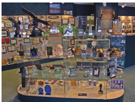
▲ A view of Joan's showroom.

Our products are displayed in easily defined categories to make finding and choosing an award a simple process. Most showroom items are presented fully engraved with logos, artwork, and sample text, which help