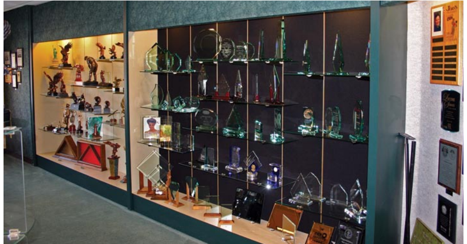
▲ Jade and crystal awards are prominently displayed.